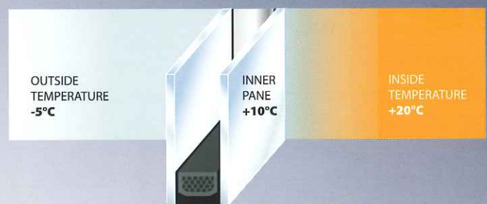
DOUBLE GLAZED UNIT using SGG Planitherm Total+