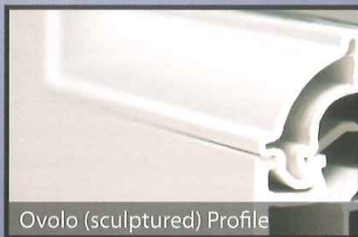
Ovolo (sculptured) Profile

THE 'NEW GENERATION' ENERGY-EFFICIENT WINDOW from WindowWise