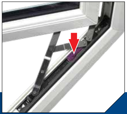
By pressing down on the purple button, the sash is released and can slide along it's hinge runner