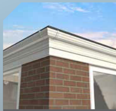
Classic Fascia (white)