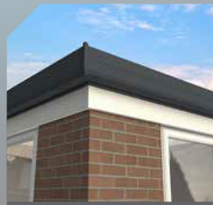
Two Tier Cornice Fascia (grey/white)