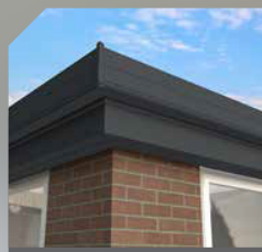
Two Tier Cornice Fascia (grey)