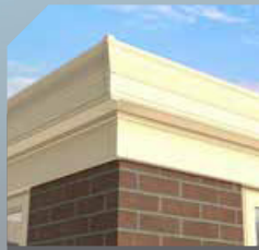
Curved Cornice Fascia (cream)