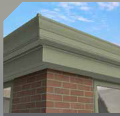
Curved Cornice Fascia (green)